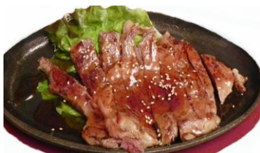
#35 Beef Teriyaki $15