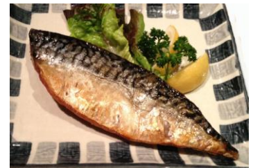
#34 Saba (mackerel) $9 Teriyaki or salt