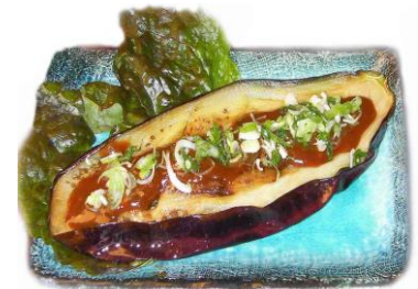
#30 Nasu Dengaku $6 (eggplant w/ miso)