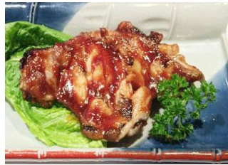
#26 Gindara Kama $7~ $20 (black cod cheek w/ miso)