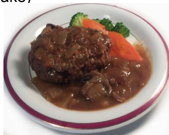
#36 Slow cooked Hamburger Steak $11 煮込みハンバーグ