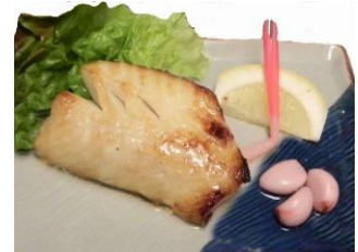
#27 Gindara Kasuzuke $12.5 (black cod marinated w/sake)