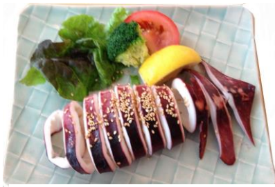
#28 Ika yaki $8.25 *Teriyaki, ginger or salt