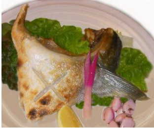
#25 Hamachi Kama $13 (yellowtail cheek)