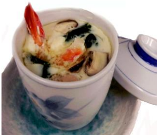
#31 Chawan-mushi $6.75 shrimp, chicken, vegetable, in egg custard)