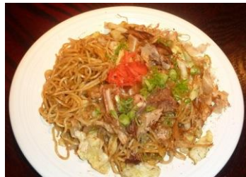
#29 Yaki Soba $12 (noodle & pork w/bonito flakes)