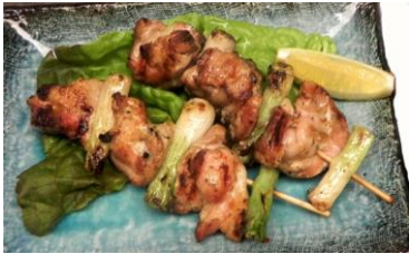
#21 Yakitori $6 *Salt or Teriyaki (chicken skewers)