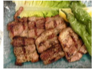
#24 Tontoro $7.5 (pork cheek w/ salt)