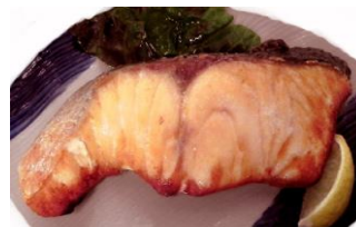
#33 Salmon $10 Teriyaki or salt