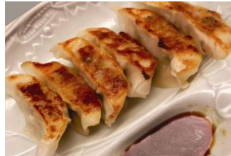
#22 Gyoza $6 #22 Vegetable Gyoza 6