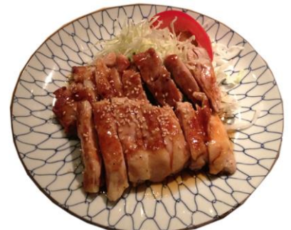
#37 Chicken Teriyaki $9.5