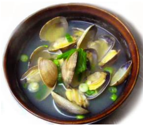
#32 Asari Saka mushi $8 (steamed clam w/ sake)