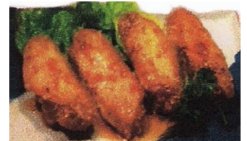
#47 Tori Teba (w/ tare) $8 (chicken wing) 3 or 4 Pieces depending on size