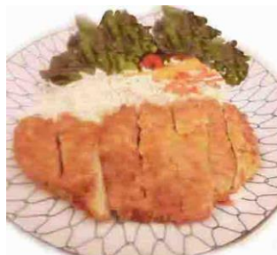
#60 Ton katsu $9 (pork)