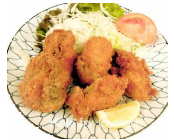
#54 Kaki fry $10.5 (oyster)