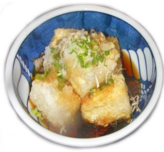
#44 Agedashi Tofu $5.75