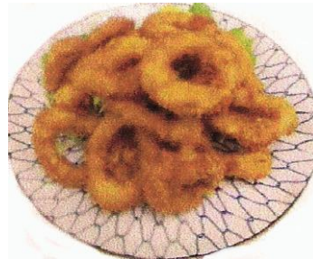
#53 Ika Ring fry $9.25 (squid)