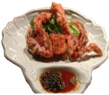
#45 Soft shell crab $8.25