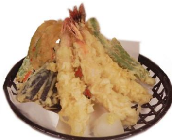
#55 Mix Tempura $12 (shrimp & vegetable)