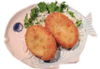
#50 Croquette $6 (potato w/beef and pork)