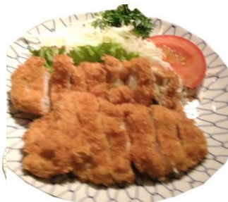
#59 Chicken katsu $9.5