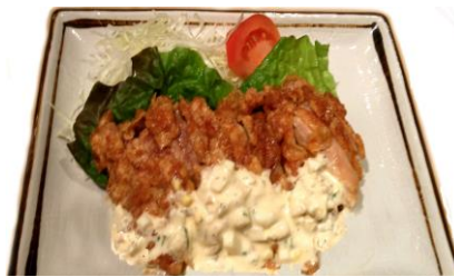
#49 Chicken Nanban $8 (marinated deep fried chicken)