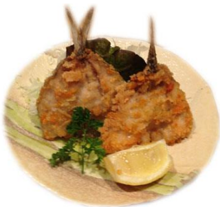
#51 Aji fry $7.5 (Spanish mackerel)