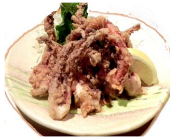
#52 Geso fry $7.25 (squid legs)