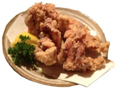
#48 Chicken Kara age $8