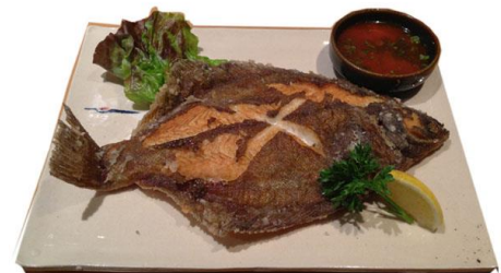
#61 Karei Kara age L size $17 ~ (flounder)