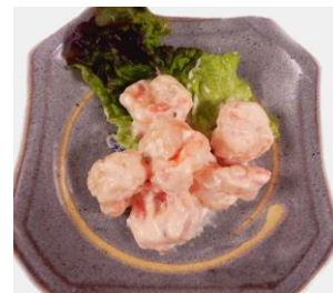
#58 Ebi Mayo $12 (shrimp w/ mayo sauce)